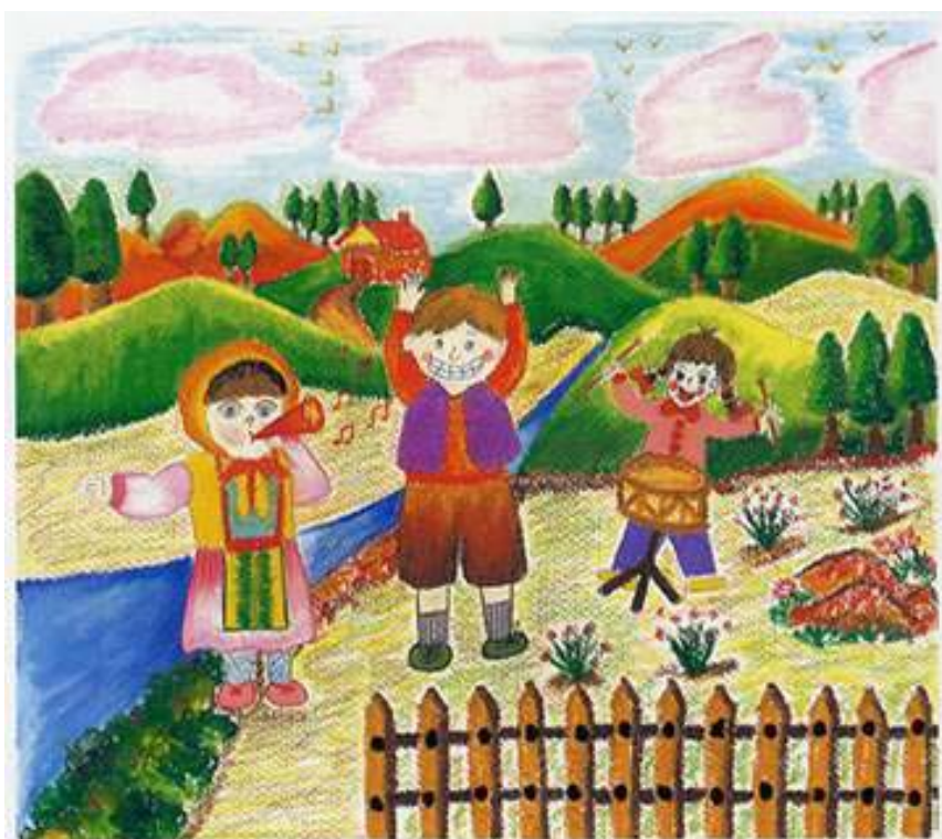
Drawing: Freeyaporn Asavapinyokit Sacred Heart Convent School, Bangkok, Thailand