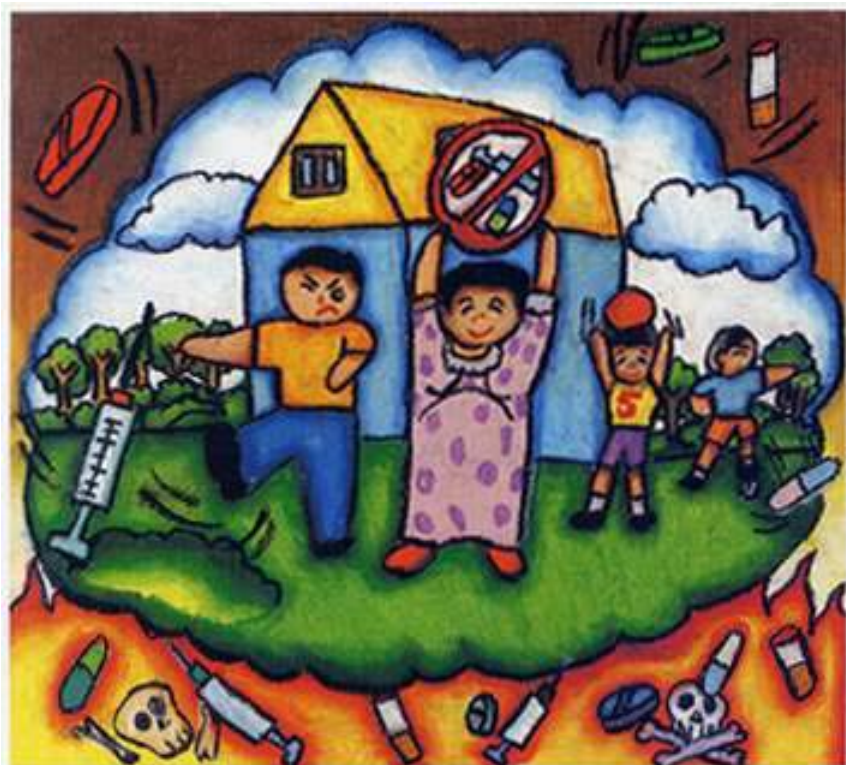
Drawing: Kavin Daengkaew Assumption Primary School, Bangkok, Thailand