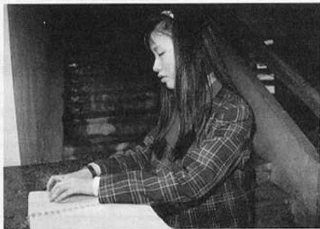
Person who is visually impaired has the right to education