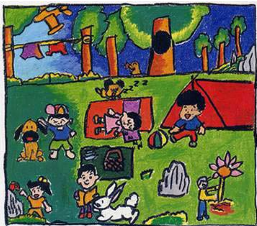
Drawing: Chainvat Kitpeka Assumption Primary School, Bangkok, Thailand