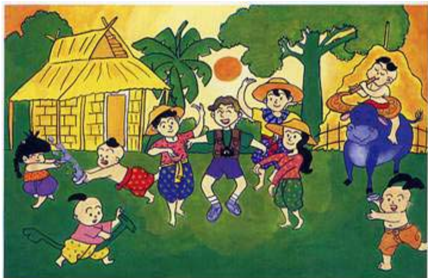
Drawing: Itthidej Boriboon Prachanad School, Samutprakarn Province, Thailand